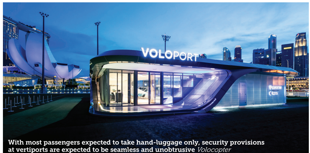
With most passengers expected to take hand-luggage only, security provisions at vertiports are expected to be seamless and unobtrusive Volocopter

Leidos has worked with many large commercial airports around the world, and is keen to lend its expertise to vertiports, according to Nicholas Ortyl: "Leidos offers a cyber-hardened, autonomous checkpoint solution that is presently deployed to help secure a variety of critical infrastructure. It would work well in a vertiport setting, where urban air-travellers could use it on a self-service basis. We're also experienced when it comes to scalability and addressing challenges. Our product is designed to anticipate and accommodate increased passenger traffic, while maintaining efficiency in screening processes, and we would establish interoperable security standards across vertiports and transportation networks for consistency and ease of operation. Emerging technologies such as AI, machine learning and sensors could enhance screening accuracy and agility, with a real-time analysis of passenger behaviour patterns to pre-empt threats. Also, algorithms can be used to assess passenger profiles and detect potential security risks by cross-referencing against watchlists." AI