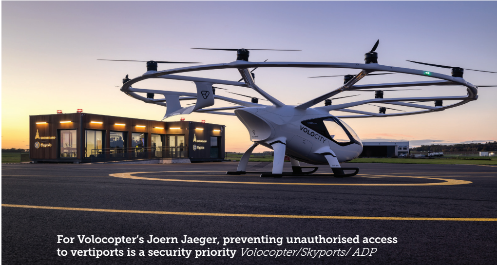
For Volocopter's Joern Jaeger, preventing unauthorised access to vertiports is a security priority

To ensure that operations run smoothly, regulators, operators and vertiports will all need to work together when it comes to data sharing. Skyports' Ankit Dass observed: "That needs to happen if you're using a database to check the identity of the passenger. Due to the efficiency required, a lot more co-operation is needed than in traditional aviation. Also, a challenge we're anticipating is cross-border flights being offered, as then you need to add passport checks. For this we're talking to technology companies like SITA, as we want see if passport control can be handled using a software solution or even NFC technology. So if a passenger has their phone with them, simply walking through the checkpoints with it could give the operator everything they need."