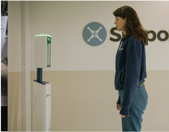
Left: Vertiports will be small, meaning that security data is more likely to be stored on the cloud rather than on-site Skyports

security process that is flexible, scaling up and down according to the likely threat. This means collecting data locally and internationally, and introducing extra measures accordingly. We also think there should be a random screening programme to mitigate those trying to work around the established processes. Depending on the threat level, the nature of the checks and frequency can also vary.”