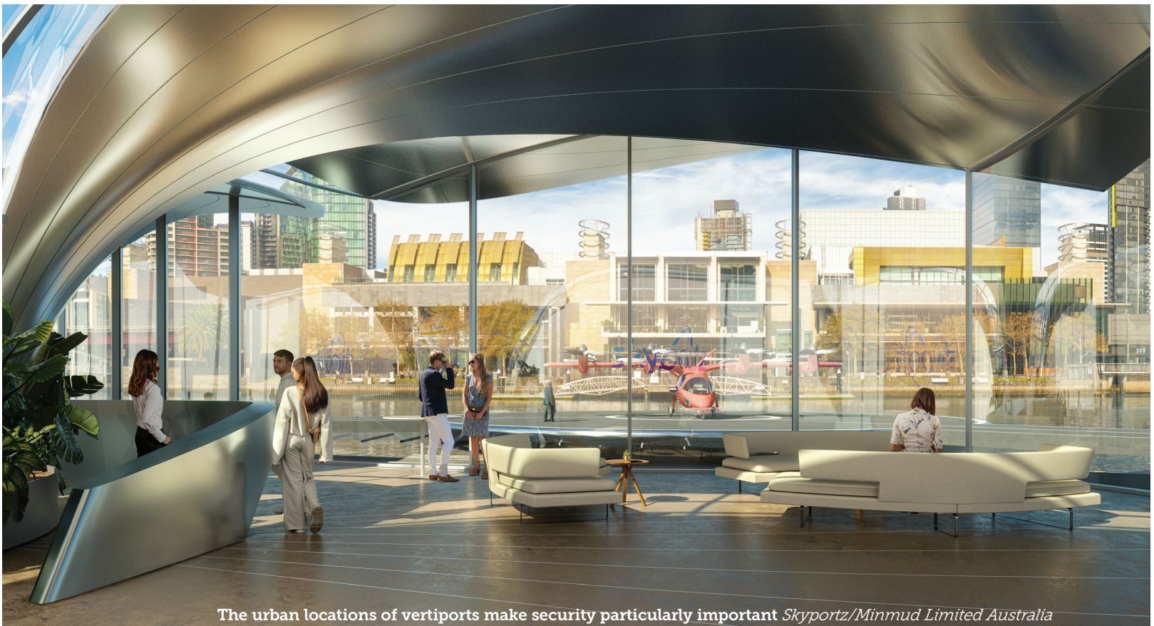
The urban locations of vertiports make security particularly important Skyportz/Minmud Limited Australia